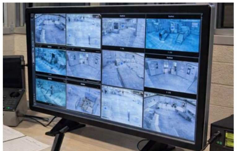
Integration with the Genetec video system