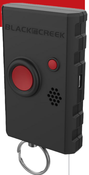
PERSONAL SAFETY DEVICE (PSD)