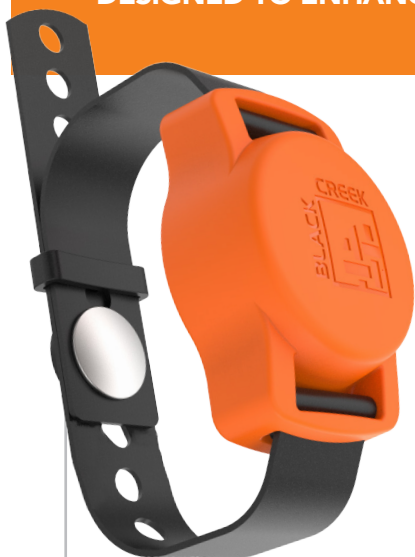
PERSONAL ACTIVE SECURITY SENSOR (PASS)